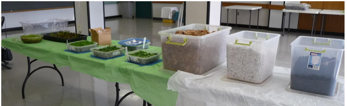
Asplenium trichomanes “Maidenhair Spleenwort”